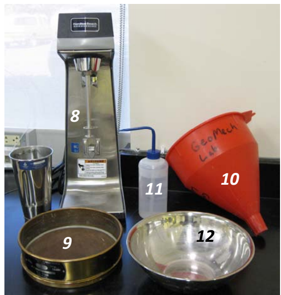
Figure 2: More materials needed for grain size analysis. (8) malt mixer (9) 63 micron sieve (10) red funnel (11) squirt bottle (12) evaporating dish.